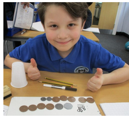
Learning about money in Maths – Making different totals.

Rapid Covid Tests are now available for all parents and carers of school age children. You are being offered free rapid, lateral flow tests if you are not showing any symptoms. This is to help stop the spread of coronavirus. Around one in three people with coronavirus have no symptoms, so by booking regular tests you're helping to protect yourself and others.