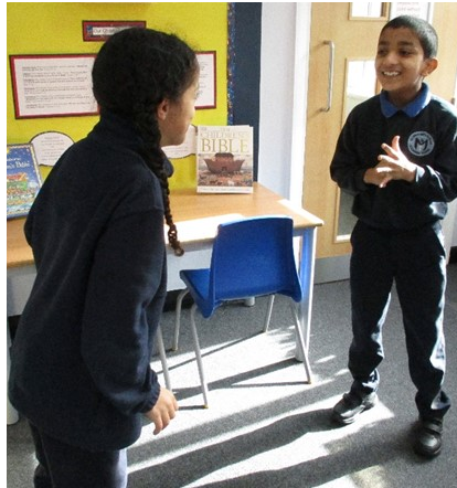
Role-play in English – Exploring using dialogue between two superheroes before writing direct speech in books.